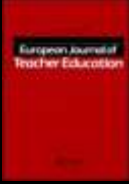
European Journal of Teacher Education