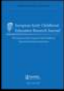
European Early Childhood Education Research Journal