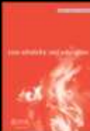
Race Ethnicity and Education