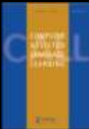
Computer Assisted Language Learning