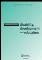
International Journal of Disability, Development & Education