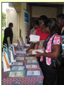
Delegates at the Cameroon workshop.

The University of Buea on the slopes of soaring Mount Cameroon played host to the inaugural Commonwealth Summer School and interlinking RIMI4AC Research Management initiative.